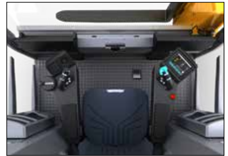
Split operation control (optional on all EKX 4 and 5 series configuration, but not compatible with freezer package on any model)