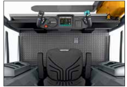
Center operation control (standard on all EKX 4 and 5 series configurations)