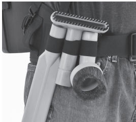
Accessory loops keep tools handy while operating.