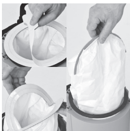
Full dust bag can be sealed before removal to contain all dirt.