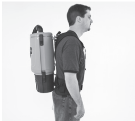
Adgility™ XP fits comfortably on the operator.